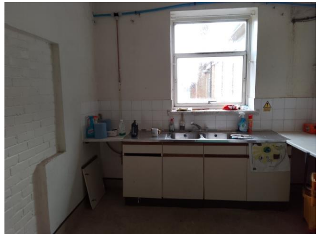
Figure 4 Community Space kitchen