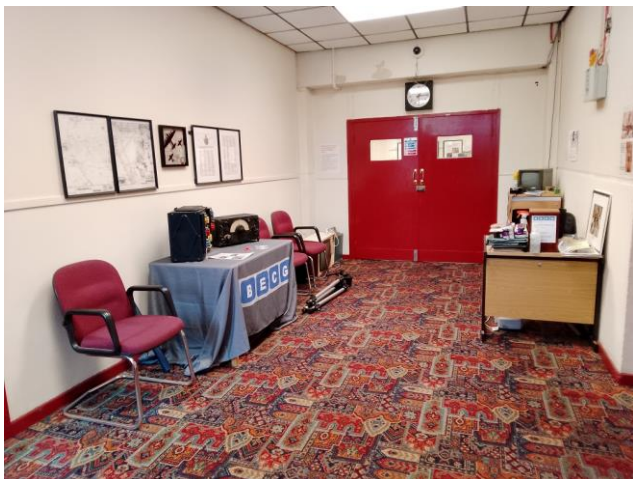
Figure 5 Main entrance area 5