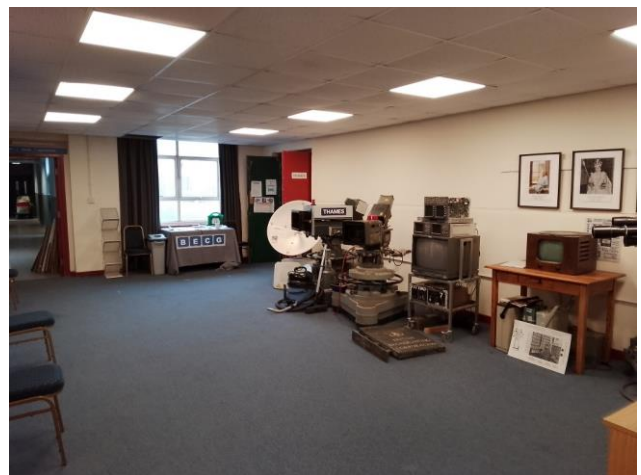
Figure 6 Hall entrance area A12