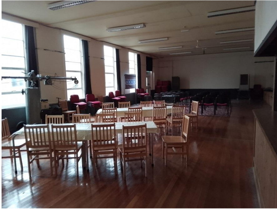
Figure 2 Community Space Hall general view #2