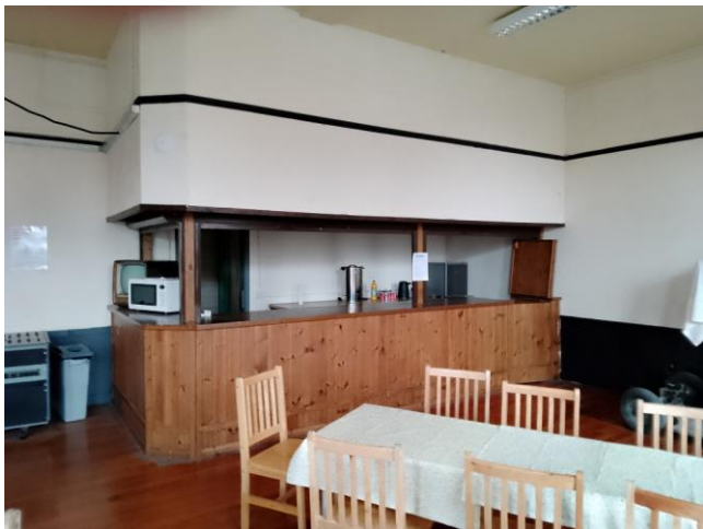
Figure 3 Community Space Hall bar