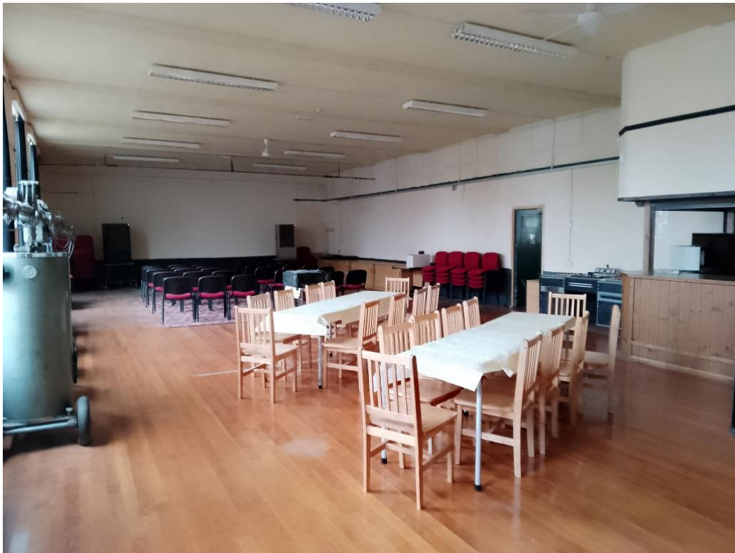
Figure 1 Community Space Hall - general view #1